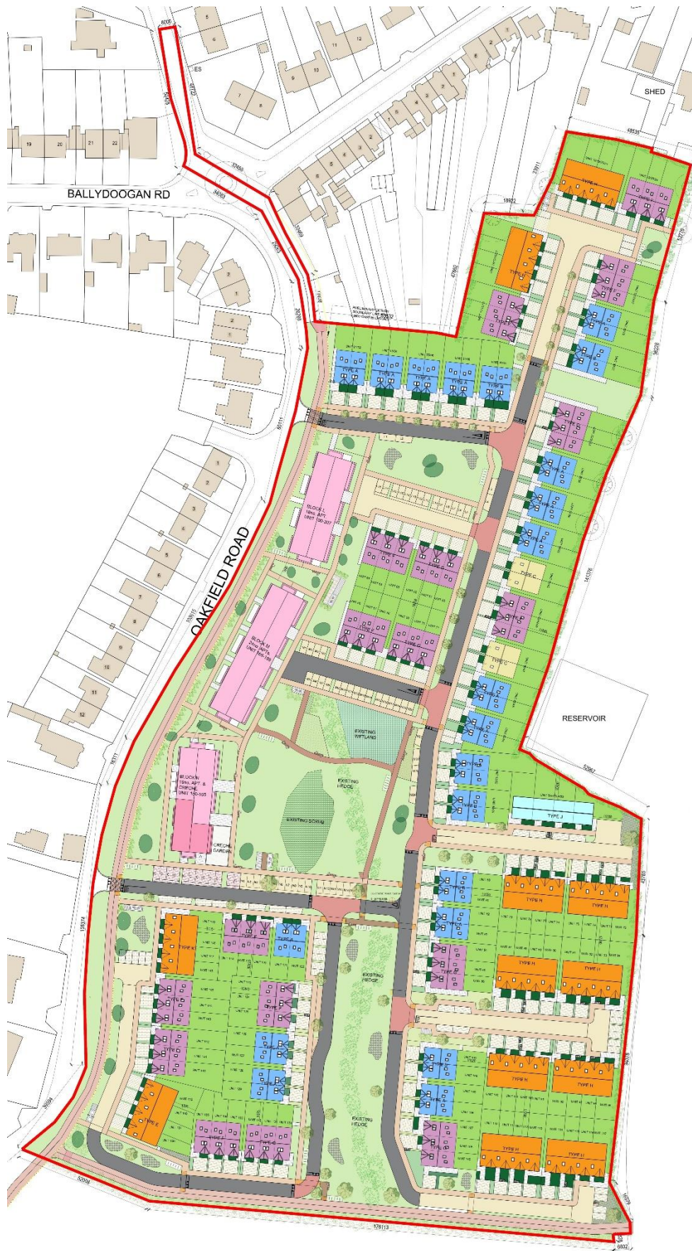
Figure 3 Proposed Oakfield LRD Scheme